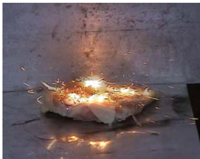
Liquid Splatter and Sparking

The reaction with asphalt was as expected. Two of the three liquid tests produced detonation of the asphalt sample. Operators who have worked with \text{ClF}_3 have reported that leaking cylinders can sometimes sound like firecrackers going off every few minutes due to the liquid drops contacting the ground. In the design of a \text{ClF}_3 system, one must insure that there are no combustible materials on the floor surface in the vicinity of the system.