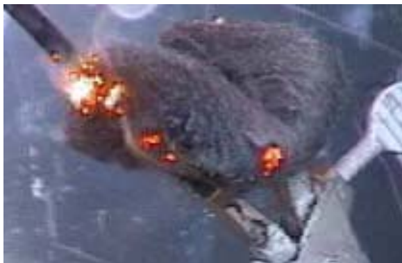
Figure 6: Residual Vapor Exposure on Steel Wool and Tyvek® Suit

evident in the chicken tests where brief flashes were noticed in the tubing outlet, probably due to vaporized chicken fat severely reacting with the residual \text{ClF}_3 vapor.