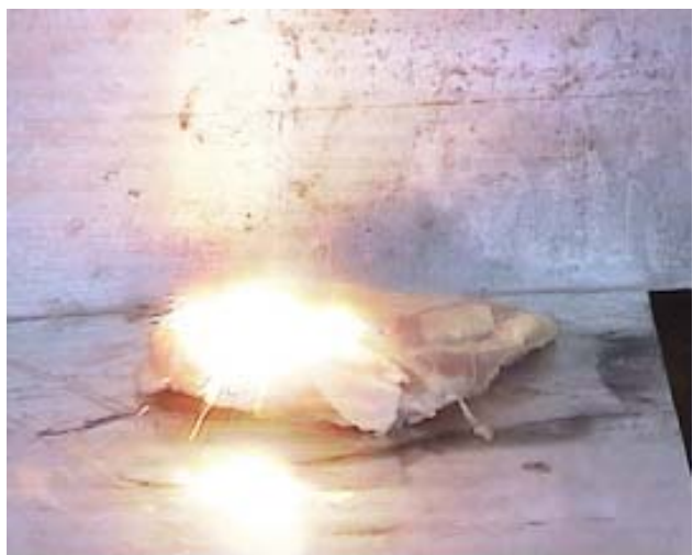
Liquid Drop First Contact