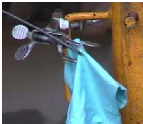
Figure 4: Vapor \text{ClF}_3 Exposure to Nitrile Gloves, Clean and Oil Contaminated

One of the most significant findings was how reactive chlorine trifluoride can be with common contaminants such as water or hydrocarbon (e.g., oil). In some cases where there was no reaction between liquid \text{ClF}_3 and the sample, if liquid contacted water or oil contamination near the test sample, the reaction heat was sufficient to ignite the sample material. This phenomenon was very evident in liquid exposure testing on contaminated nitrile gloves, used polyethylene tubing (Figures 4 and 5), and oil contaminated surfaces. Therefore, maintaining cleanliness with any materials that may come into contact with \text{ClF}_3 , and especially PPE, is of paramount importance.