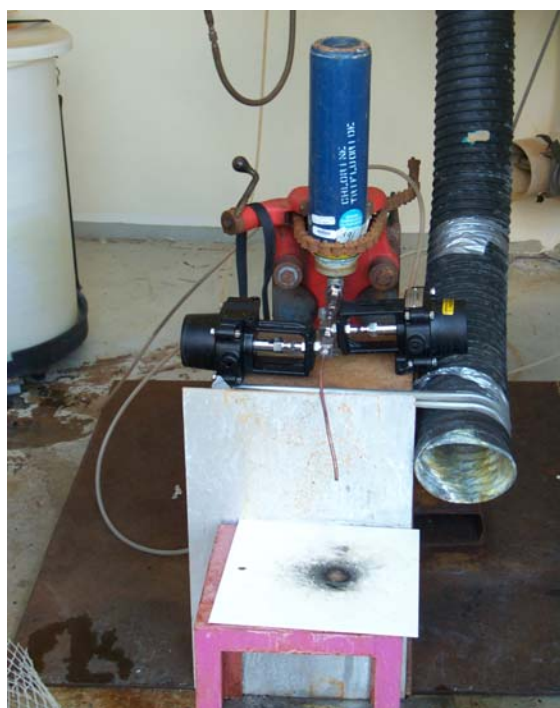
Figure 3: Chlorine Trifluoride Liquid-Phase Exposure Testing Apparatus

It is important to note that all equipment used in this testing was specially selected, assembled, and cleaned to meet Air Products' standards for fluorine and its oxidizing compounds. Also, the testing was performed and attended by personnel very experienced in the hazards and behavior of \text{ClF}_3 reactions.