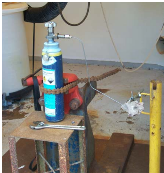
Figure 2: Chlorine Trifluoride Vapor-Phase Exposure Testing Apparatus

The vapor-phase exposure testing was conducted using a 51 cm (20 inch) long piece of 0.312 cm (0.125 inch) diameter stainless steel tubing connected directly to the cylinder with the use of a CGA-670 nut and nipple. The cylinder was mounted upright in the vertical position inside the vent booth on a metal stand. The outlet of the vapor discharge tubing was directed at the target piece, which was held by a laboratory clamp and stand (Figure 2). For added safety, a local vent snorkel was positioned behind the target piece to assist in fume removal. The flow of the vapor was controlled by manual operation of the cylinder valve.