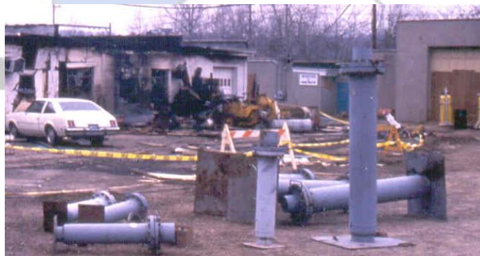
Fig. 4: Cylinder Overpacks

A phosphine mixture cylinder was leaking and on fire for almost a week. Since it was next to an arsine cylinder there was concern that it would cause it to leak as well. The officials extended the evacuation zone to ½ mile. Approx 1500 people including a nursing home (120 residents) were evacuated from Thursday to Sunday as the DEP and private contractors worked to stabilize and remove the leaking or damaged cylinders. There was concern that the phosphine cylinder would leak for a few more weeks so the waste disposal company placed the phosphine cylinder onto a metal plate and surrounded it with sandbags. They then put a shaped charge on it and blew it up. A number of arsine cylinders were leaking. Seven cylinders were placed in cylinder overpacks and removed.