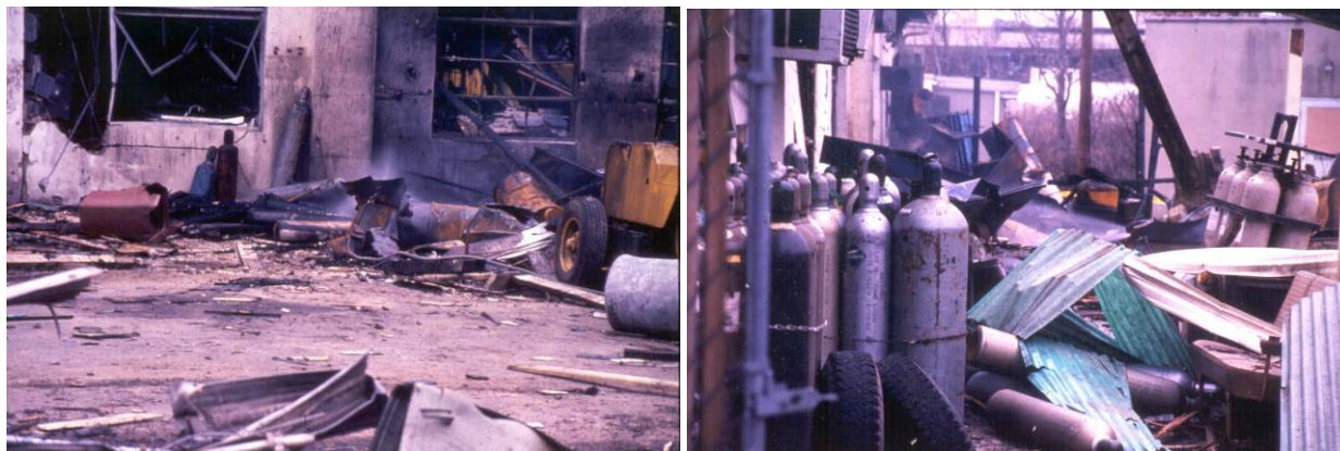
Figs. 2 and 3: Damage to Building and Room

tangled up with hoses from a helium bundle in a dumpster. He lost part of a leg and 4 fingers. The explosion occurred at 1:51 AM