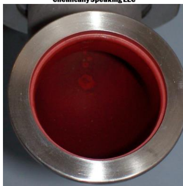
Fig. 1: Red selenium

These tend to plug systems such as MFC and regulators.