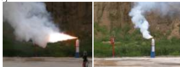
Figures 2 and 3: A silane release from a cylinder valve without (left) and one with a 0.010” RFO (right).

cfm (70.8 lpm). The resulting jet flame is 3 m versus 0.5 m. [13]