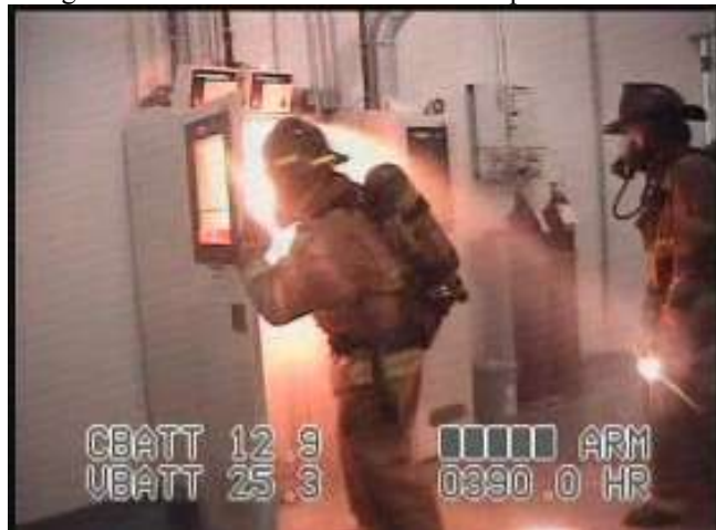
Figure 6. Gas supplier response to a silane fire.

Numerous incidents involving a silane release and fire have also occurred. Emergency responses to these present a challenge to the user ER team or local fire department.