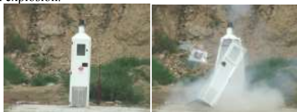
Figure 5. Gas cabinet silane explosion [11] [12] [14] [15]

While Silane is a very pyrophoric gas with a wide flammable range, it can be released without immediate ignition. While most releases result in an immediate fire, silane under certain conditions has been released without immediate ignition. After a delay it suddenly ignites causing an explosion.